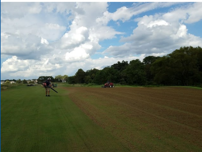
Our summer aeration procedure.